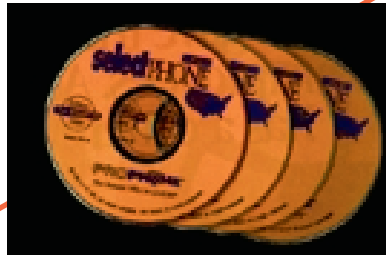
SEARCH NO MORE

Revo sunglasses use lenses originally developed for the space program. Their unprecedented clarity and outrageous metallic colors are the reasons I own four pairs. I never thought I needed a fifth... until now. The US$195 Revo Wraps hug the face to reduce wind resistance, and the full-peripheral lenses protect the eyes without interfering with vision. When my outings involve high-speed bike rides, ski runs, or pickup basketball games, Revo Wraps are my shades of choice. (800) 367-7386, +1 (415) 962 0906.