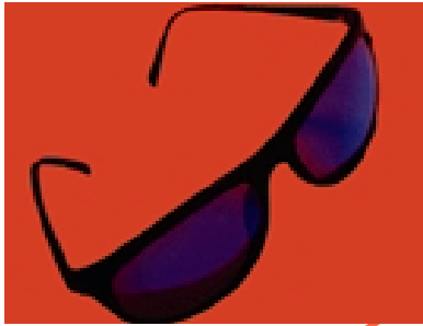
BEYOND MIRROR SHADES

Revo sunglasses use lenses originally developed for the space program. Their unprecedented clarity and outrageous metallic colors are the reasons I own four pairs. I never thought I needed a fifth... until now. The US$195 Revo Wraps hug the face to reduce wind resistance, and the full-peripheral lenses protect the eyes without interfering with vision. When my outings involve high-speed bike rides, ski runs, or pickup basketball games, Revo Wraps are my shades of choice. (800) 367-7386, +1 (415) 962 0906.